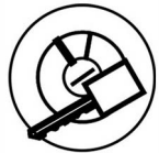
POSITIVE IGNITION OUTPUT

The interface generates 12 V Ignition feed upon engine cranking.