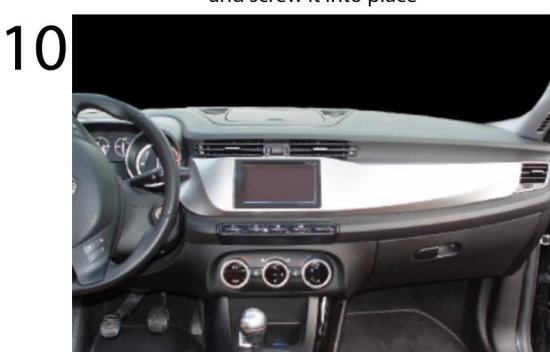
Clip the facia into place. Installation is now complete