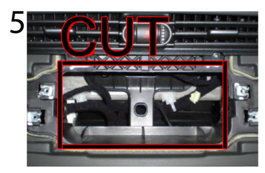
Cut the plastic frame and remove it