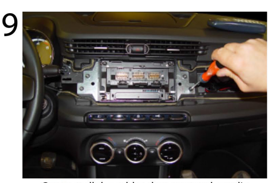
Connect all the cables then mount the radio and screw it into place