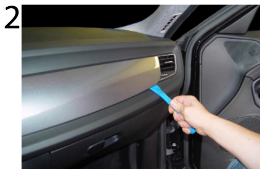
Remove the original panel starting at position Shown