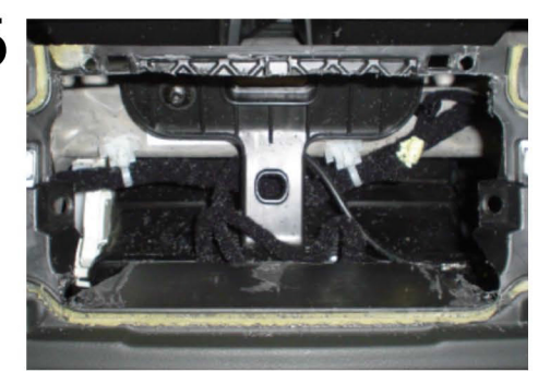
This is the result after cutting the plastic frame