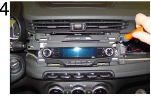
Use a screwdriver to remove screws from the original car-radio