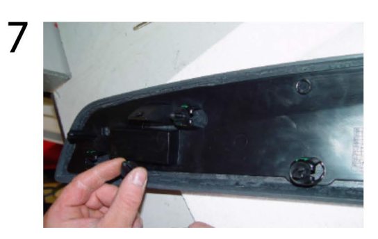
Insert the snap fastener to the radio frame supplied with the kit