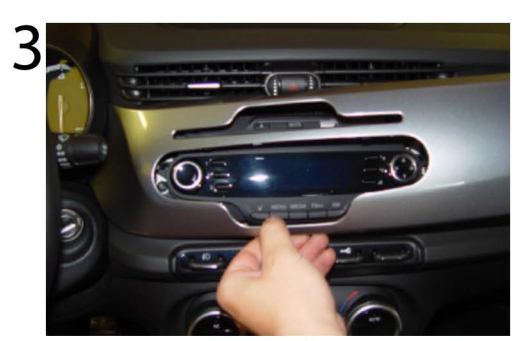
Unclip the trim frame surrounding the OEM head unit and remove it