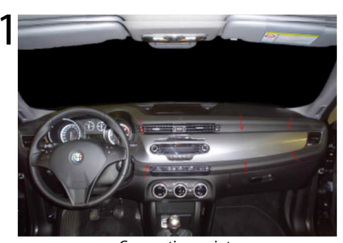
Connection points radio frame / Dashboard