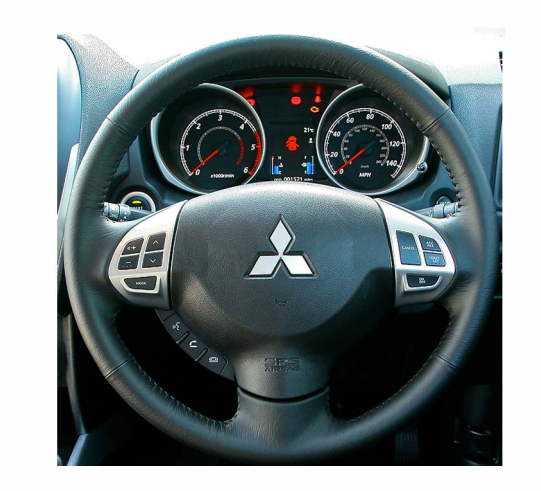
Steering Wheel Control Functions

For Vehicle Compatibility visit https://aerpro.com/ FP9212K