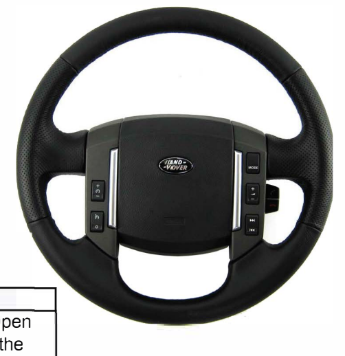
Steering Wheel Control Functions

For Vehicle Compatibility visit https://aerpro.com/ FP9290K